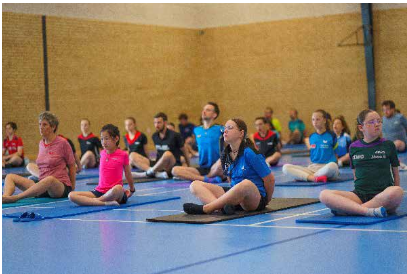
Yoga every morning.