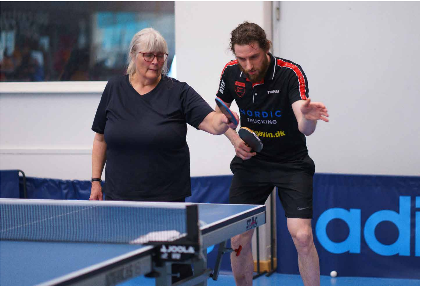
Improvement has no age.